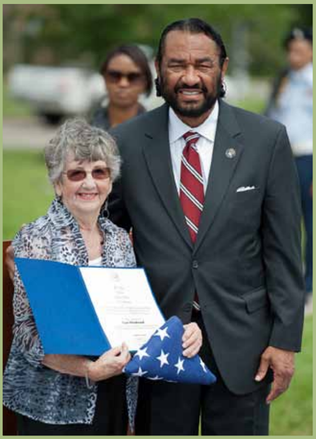
Rita Woodward with Congressman Al Green