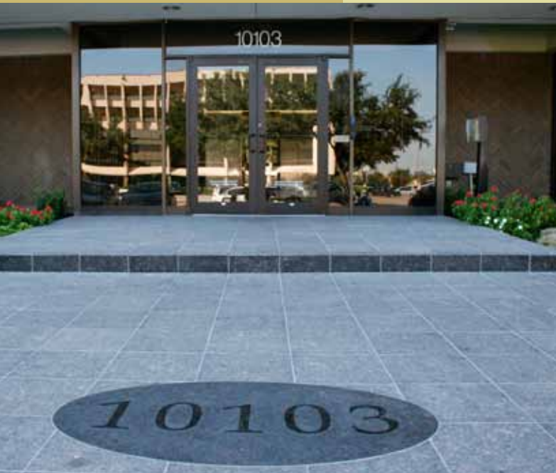
THE BRAYS OAKS TOWERS